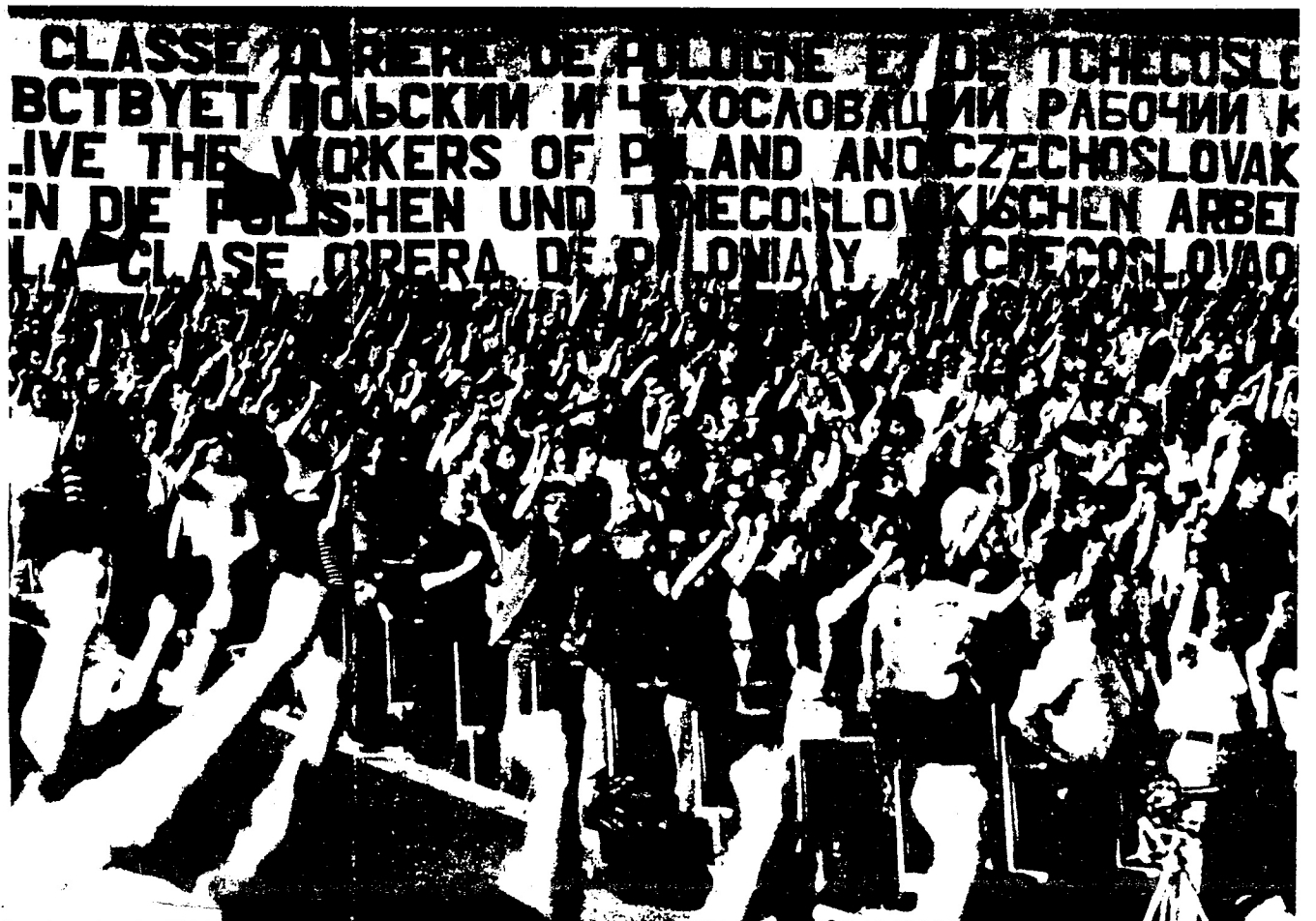
Attended by 5000 youth from all over the world, including the countries of socialist conquest, the Essen Conference was an important gain in the struggle to build the Revolutionary Youth International.

Another thing I see is the armed forces, that's part of the working class; its young, young people are in that. The way things are now, I just couldn't see them firing on us, their parents or their brother or sister, somebody that's