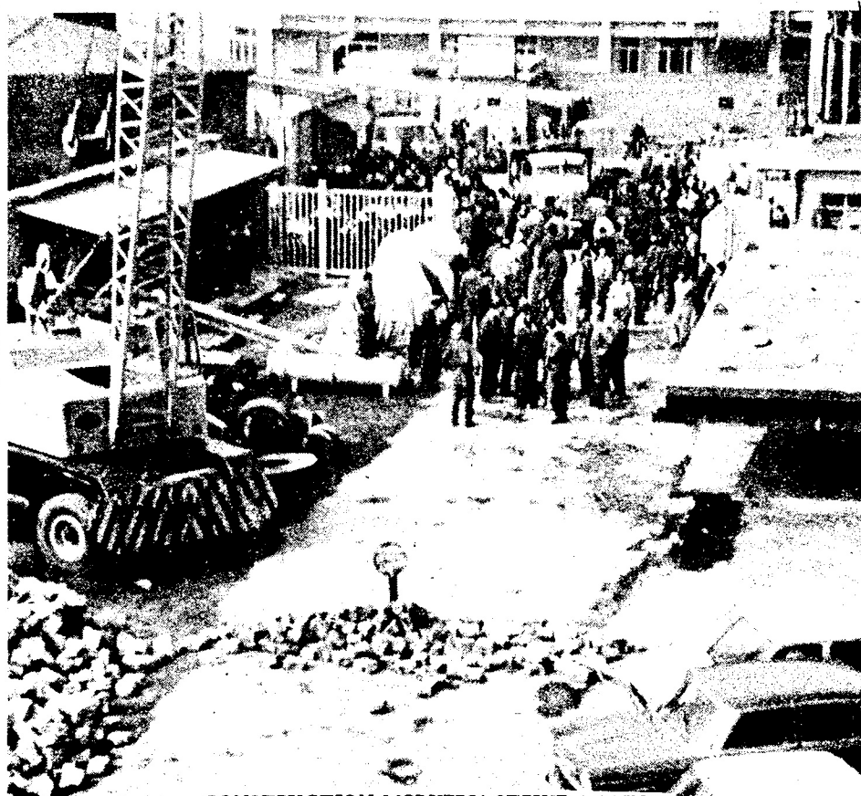
CONSTRUCTION WORKERS' STRIKE AGAINST THE EXECUTIONS IN BASQUE PROVINCES