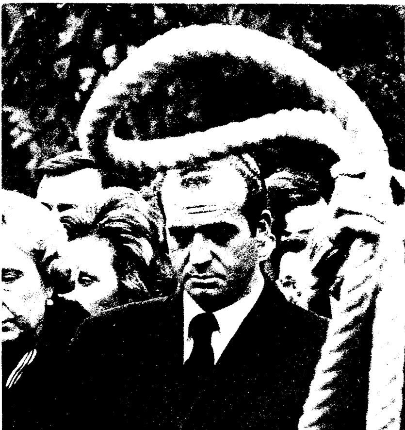
JUAN CARLOS "ROPED" INTO NEW JOB

It is necessary to rebuild the Fourth International which only the International League is doing. This is the vital question for the working class of Spain and it is the vital question for the young workers in America.